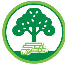
TIMBER & PULP